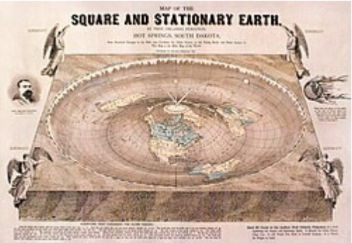
Flat Earth map drawn by Orlando Ferguson in 1893 and lithographed by Louis H. Everts & Co. The map contains several references to biblical passages as well as various attacks at the "Globe Theory". https://en.wikipedia.org/wiki/Orlando_Ferguson